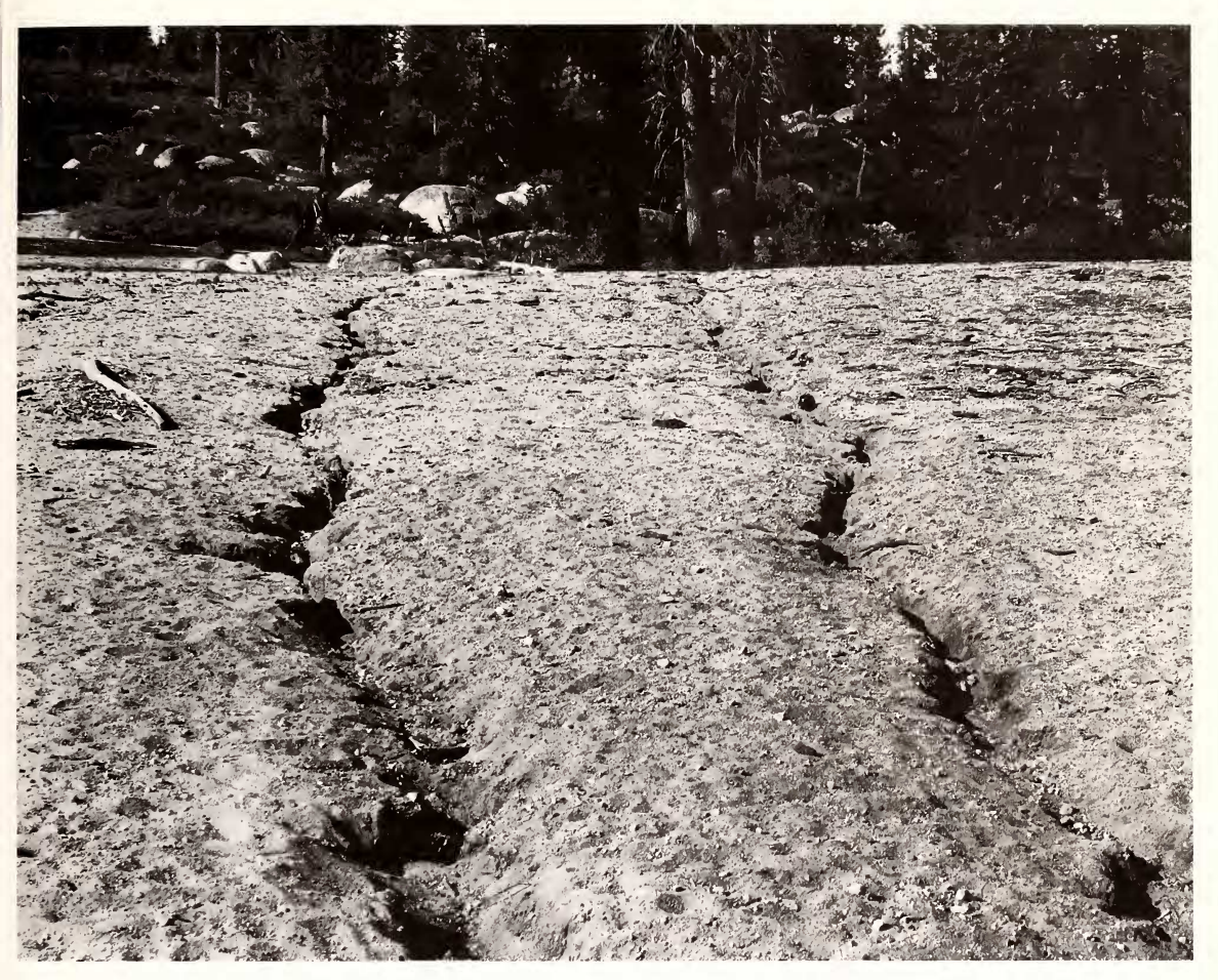
FIG. 3. Calvaras county, 1899. About 3 km (2 miles) south west of Bloods. Sandy ridge grazed clean and bare by sheep, gullying.